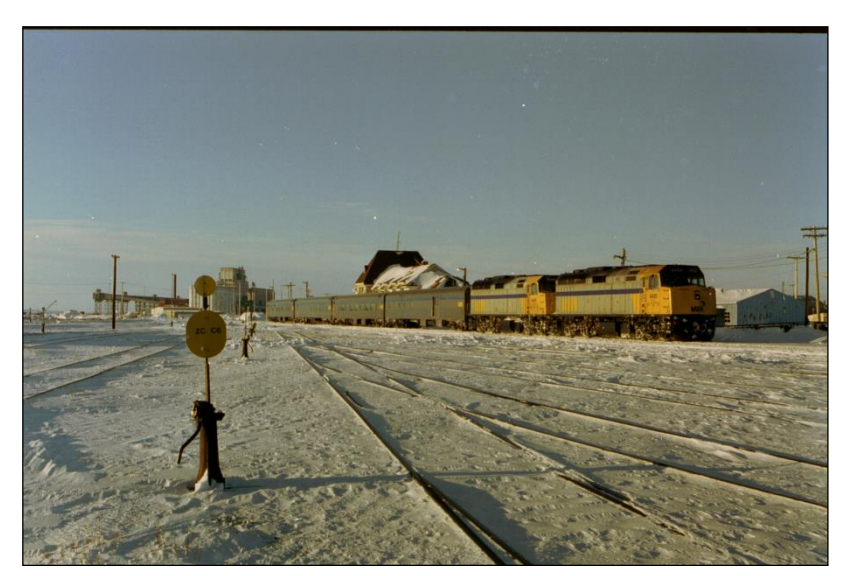
Figure 4. Via Rail Station in Churchill, Manitoba.

Tourism in the North is a growing business as a result of falling transportation costs and marketing of new and exotic Northern experiences. The North has always been appealing as one of the last frontiers and is rich in material resources. The USGS recently estimated that 25 percent of the world's oil reserves lie under the Arctic Ocean.