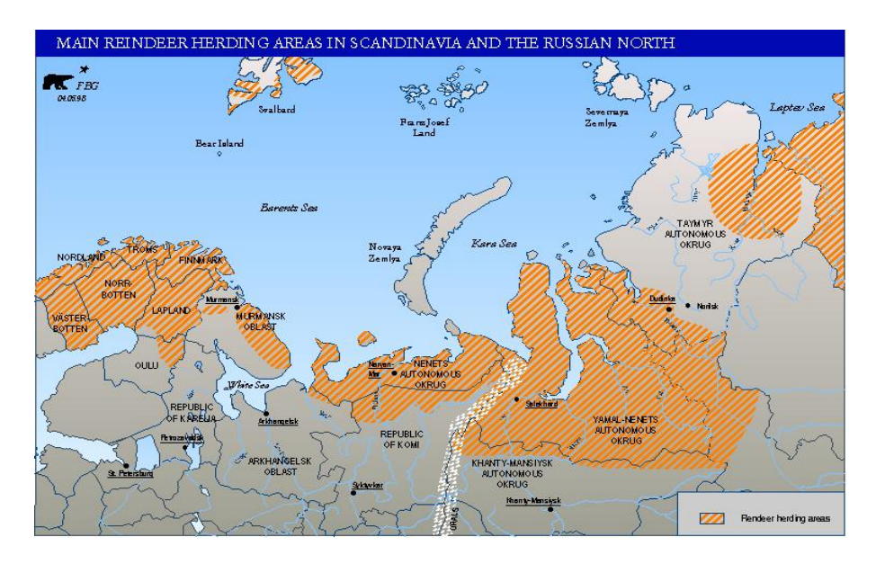
Figure 2. Traditional Reindeer Herding Areas the Barrents Euro Arctic Region

Sámi in Scandinavia, Finland and Russia have controlled herding and hunting by regions where family clans are responsible for land allocation and governance. These regions are traditional family areas. Figure 2 illustrates traditional lands where reindeer herding occurred in northern Europe.