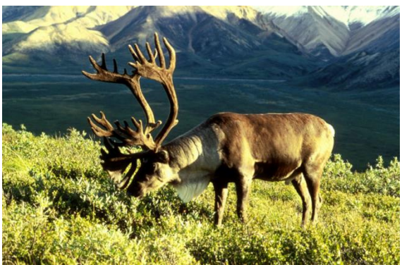
Figure 1. Male Caribou in Alaska

Sámi in Scandinavia, Finland and Russia have controlled herding and hunting by regions where family clans are responsible for land allocation and governance. These regions are traditional family areas. Figure 2 illustrates traditional lands where reindeer herding occurred in northern Europe.