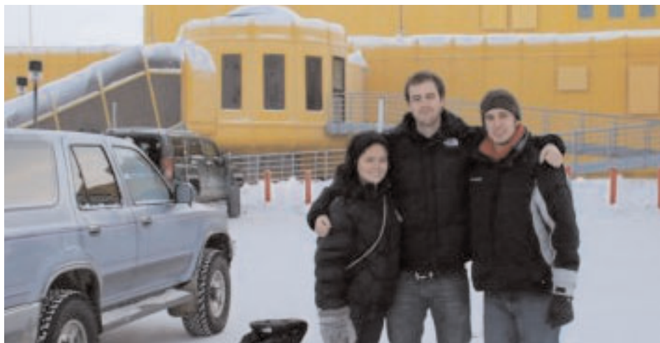
A new generation is taking an active interest in traditional knowledge.

Nunavut is under pressure to meld the Inuit culture and southern systems and this clash is most obvious in the territory's capital. It is here where examples